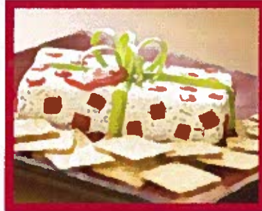
Christmas Package Cheese Snack